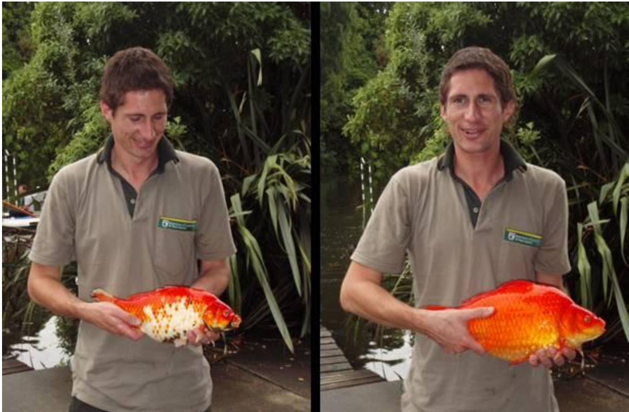
Figure 4: Examples of the large (>300 mm FL), highly coloured goldfish which have been mistaken for koi carp by the public in the Hokowhitu Lagoon, Palmerston North.