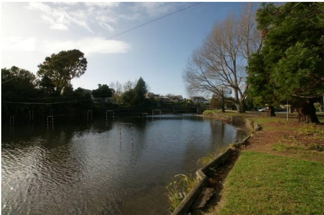
Figure 2: Photo of Hokowhitu Lagoon showing the highly modified nature of the lagoon with the park on the right and the wooden retaining walls separating the water from the land.

surrounded primarily by residential homes on the northern, western and eastern sides, while the southern side is bordered by the Manawatu Golf Club, Massey University College of Education and the Manawatu River. The centre of the lagoon is located at a latitude of 40° 22' 00.00" S and a longitude of 175° 37' 49.11" E. Inflows into the lagoon include stormwater runoff from the surrounding catchment as well as a newly installed bore. The bore was drilled to 94 m to secure water from an underground aquifer and is designed to release up to 250,000 L of water daily into the lagoon which will enable the level of the lagoon to remain constant throughout the year. The outflow of the lagoon drains into the Manawatu River.